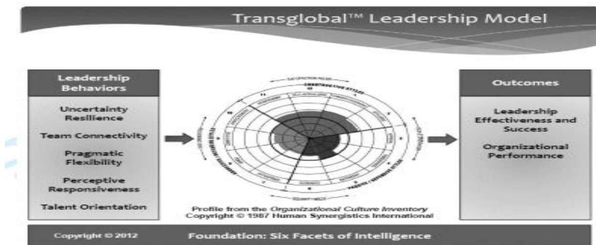
Figure 1. Transglobal leadership model

main areas, namely the achievement of organizational goals (i.e., initiation of support and evaluation information arrangements) and the cohesiveness of the people they lead (i.e., encouraging, expressing feelings, harmonizing, compromising, and maintaining gates and establishing gates standard). As time goes by, organizations develop and leadership varies as Sharkey et al. (2012) analyze theoretical problems regarding transactional or transformational leadership which are classified into local leadership types. In its early development, the leadership style appeared in the form (version) of local which was unable to reach global aspects. Therefore, Sharkey et al. (2012) construct a more global type of leadership known as transglobal leadership. Transglobal leadership transcends cultural and national boundaries, which is universal and contributes greatly to the spirit of humanity to change human civilization. Transglobal leaders make people's lives more attractive, more beautiful, more prosperous, more dignified, or better. A transglobal leader takes the idea and adapts to a new, wider, and more complex environment. A transglobal leader is more likely to support and help define a unique approach to work. Whereas local leaders do a good job of keeping a stable operation and building like-minded teams that will achieve goals repeatedly and reliably. Furthermore, the image of the transglobal leadership model can be seen in Figure 1: