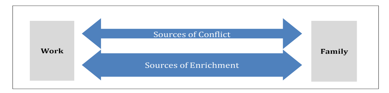
Figure 1. Simplified description of bidirectional work-life enrichment and conflicts (Greenhaus & Powell, 2006)

It was not until Greenhaus and Powell's (2006) seminal paper that the beneficial effects of multiple roles have been distilled into more precise elements and poured into a holistic theoretical framework. Besides that, they explain the direct and indirect mechanisms of interference between roles. As visualized in Figure 1, they claim that work and family have bidirectional sources of conflict and enrichment, but in a net view, they enrich each other. Thus, while conflict is a psychological stressor caused by incompatibility between roles, enrichment is a developmental phenomenon caused by a successful transfer of gains between roles.