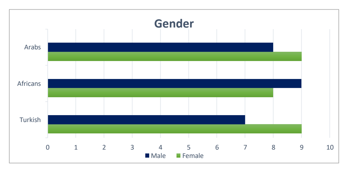
Figure 2. Gender representation of participants

The respondents were gender balanced in order to ensure that data was attained from both males and females. Gender representation of the three ethnicities is illustrated in Figure 2 below.